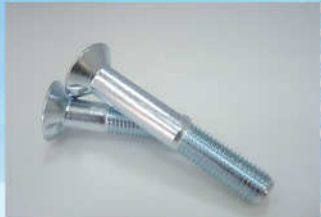
4) Flat Countersunk Nib Bolts