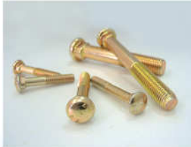
2) Track Bolts