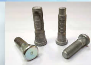
17) Round Head Ribbed Neck Bolts