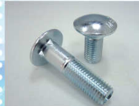
6) Round Head Bolts