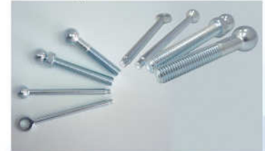
12) Custom Made Special Bolts