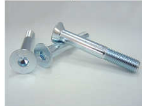
3) Countersunk Flat Head Cap Screws