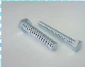
5) Coil Thread Bolts