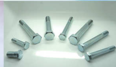
14) Hex Head Bolts