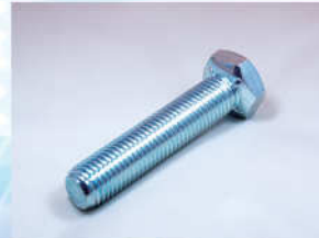
13) Multi Plate Bolts