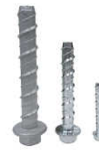
11) Concrete Bolts