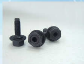
9) Special Flange Bolts