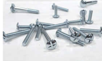
10) Roofing Bolts