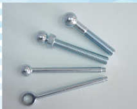
8) Custom Made Special Bolts