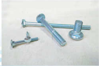
1) Carriage Bolts