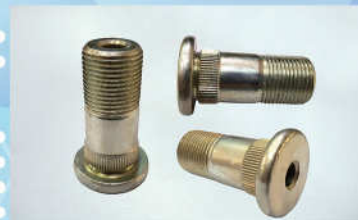
16) Custom Made Round Head Ribbed Neck Bolts