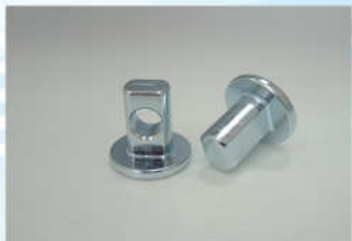
7) Special Round Head Bolts