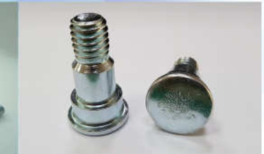
15) Custom Made Round Head Bolts